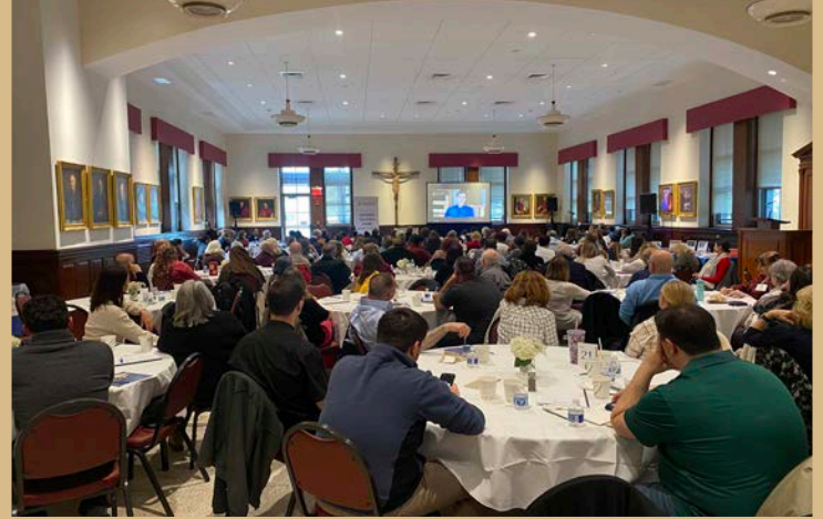
THE ROOM WAS FILLED WITH LEADERS FROM AROUND THE ARCHDIOCESE

With over 30 parishes attending the conference, there was excitement in the room. People were eager to be with others who love Jesus and love the Church. Throughout the conference, beginning with teachings about Jesus' and the Church's call to evangelize and make missionary disciples, in